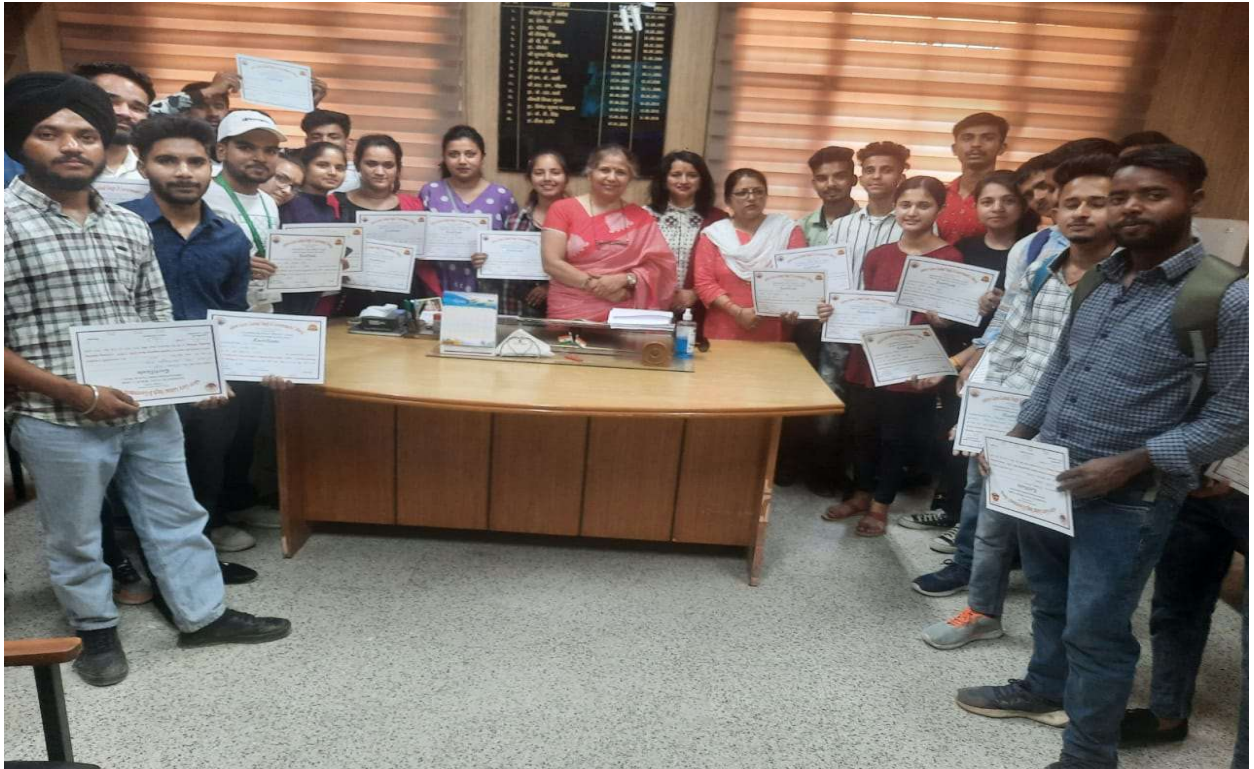
Photograph 13 Students with certificates of certificate course in English language